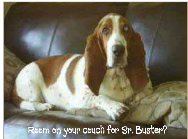
Room on your couch for Sr. Buster?

If you have a place in your heart and home for an older hound, please contact Carol at 801-631-2938. Or you can go on-line and fill out the Foster Application and indicate that you would be willing to be an Old Hound's Home.